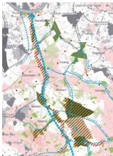
Boundary of Wandle Valley Regional Park in All London Green Grid