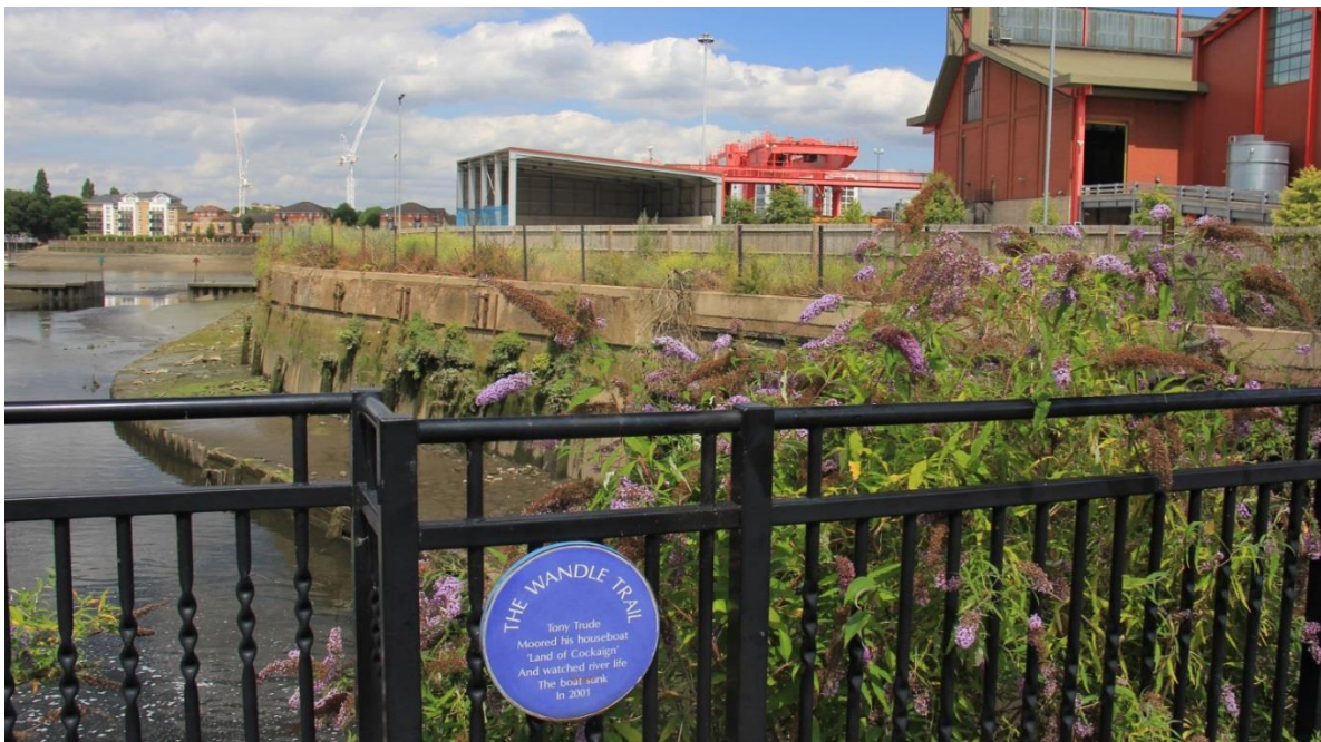
Feather's Wharf: Shows fenced off riverfront path which is both Thames Path and Wandle Trail.