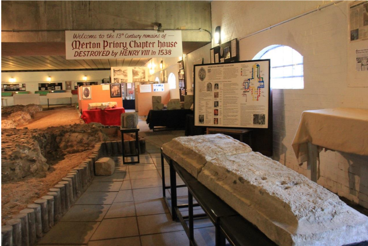
Last look at the interior of Merton Priory prior to the main work on the new museum starting shortly