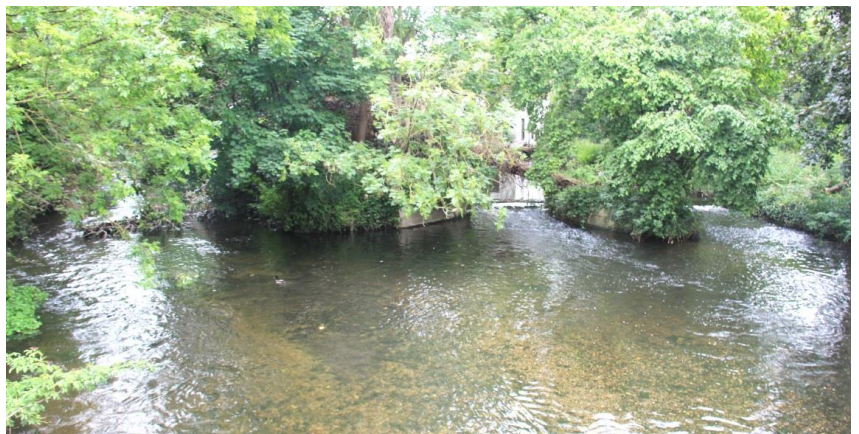
Wandle at Watermeads reach by Poulter Park from Bishopsford Rd Bridge Mitcham