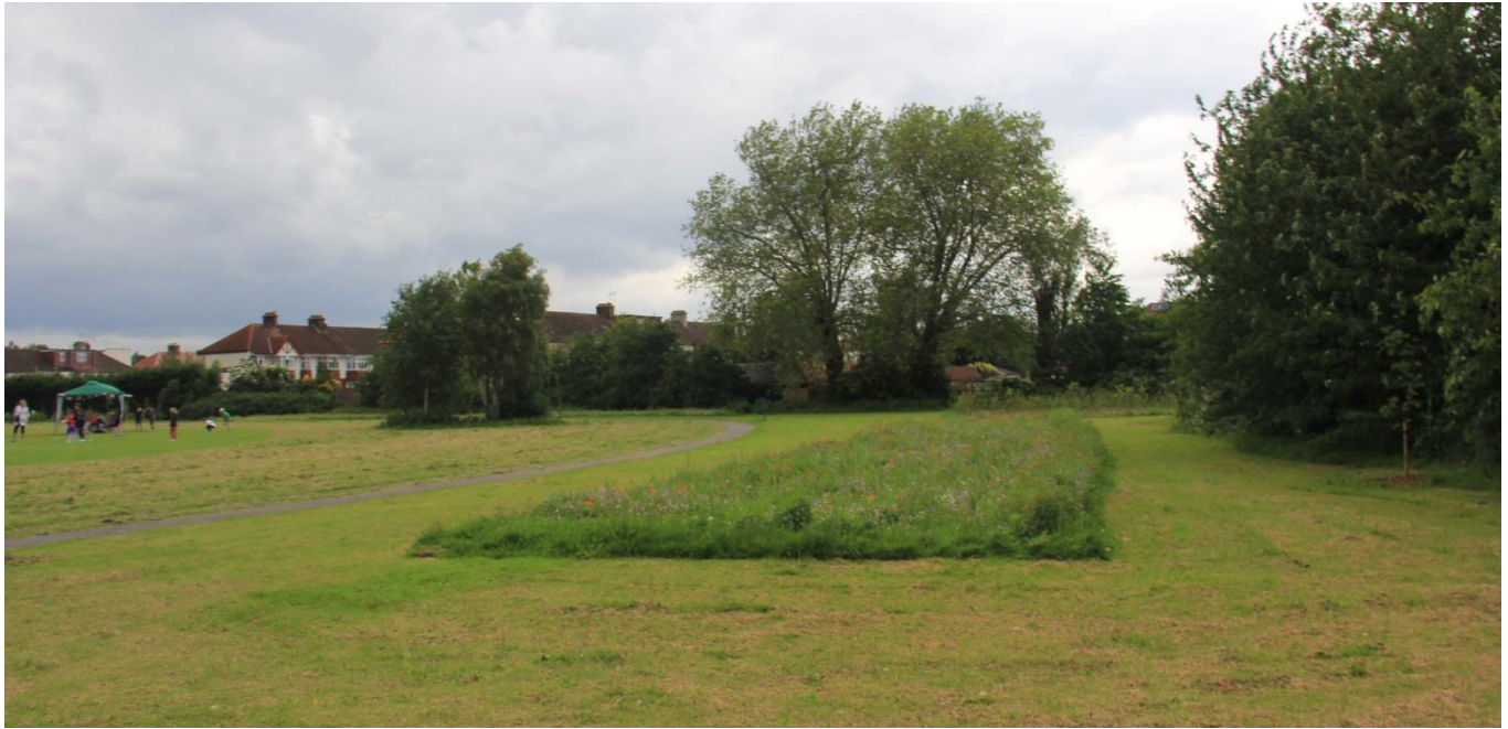
Durnsford Rd Rec. confirmed in WVRP 1

Several Forum members have raised the subject of WVRP's boundaries, so we review what we know about them here. Council parks' officers or WVRP Trustees are welcome to contribute background information (in next issue). Beneficial boundary changes have already been made, demonstrating that change is possible.