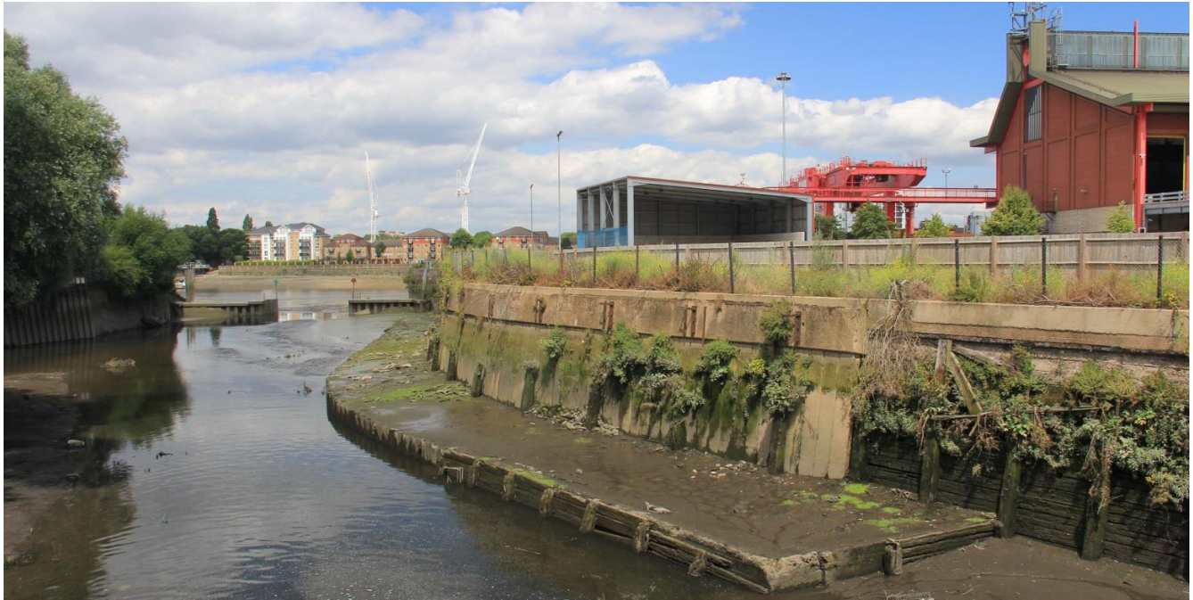
Wandle Delta with safeguarded east bank path