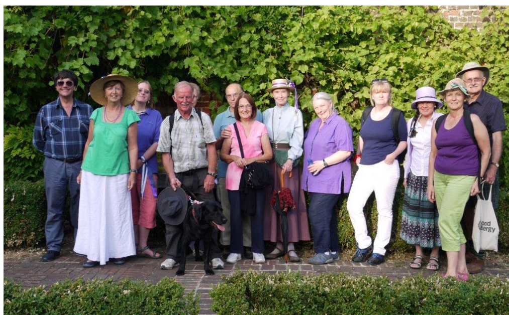
Walkers at the Peace Garden, the Canons during the Suffragettes Walk, 26 July 2013